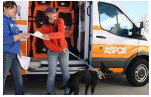
In November, we received our first ASPCA transfer of 21 dogs. It was a seamless and easy process for both the staff and animals.