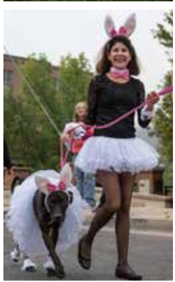
Toby's Pet Parade & Fair was attended by nearly 1,500 people and 165 dogs, raising nearly $50,000, including $5,000 in matched funds from Tito's Handmade Vodka.