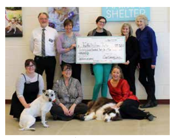
In March, we received $7,732.00 from Credit Union of Denver, from the calendar that they produced and sold to raise funds for us. Automotive Avenues underwrote the production costs.