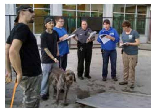
In September, Shelter staff and Jeffco Sheriff Animal Control helped evacuate 45 dogs and 1 cat out of the Genesee fire area.

The Jefferson County Public Library Summer Reading Program exceeded the 30 million minutes goal, so the Shelter was awarded $600.